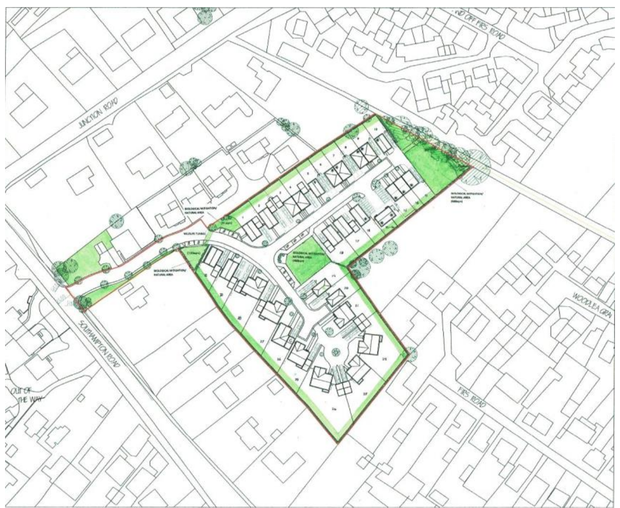
Indicative layout showing dwellings under construction to the west and the layout of the scheme granted on appeal to the north, which is nearing completion.