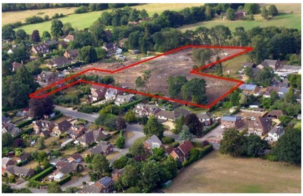
Aerial photo of application site with land to the west cleared prior to the construction of 5 dwellings now nearing completion.

The site lies outside but directly adjacent to the existing settlement boundary for Alderbury, as defined by the former Salisbury District Local Plan (adopted 2003) and carried forward and retained into the Wiltshire Core Strategy, which was adopted in January 2015. The Wiltshire Housing Site Allocations Plan 2020 (WHSAP) extended the settlement boundary for Alderbury up to the north western boundary of the site. This has the effect of the site being directly adjacent to the settlement boundary on three sides, rather than two when the previous application (19/03480/OUT) was determined.